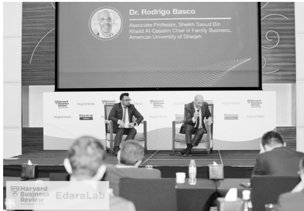
Presentation and discussion organized by Harvard Business Review Arabia