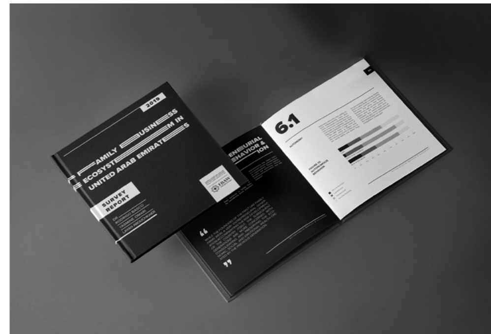
Published report "Family Business Ecosystem in United Arab Emirates"